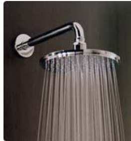
Rain & Multi-Jet Showers