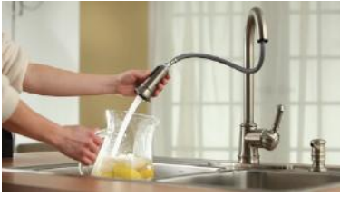
High Flow Faucets & Multi-Tap Usage