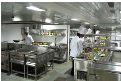
Hotels & Restaurants